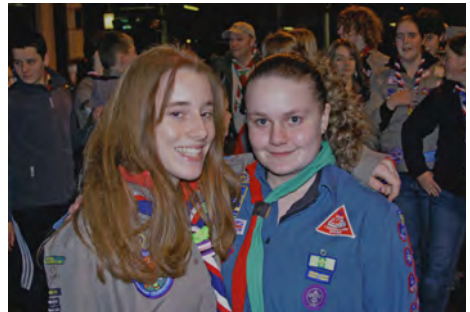
Avon and Montgomeryshire girls going to the World Jamboree